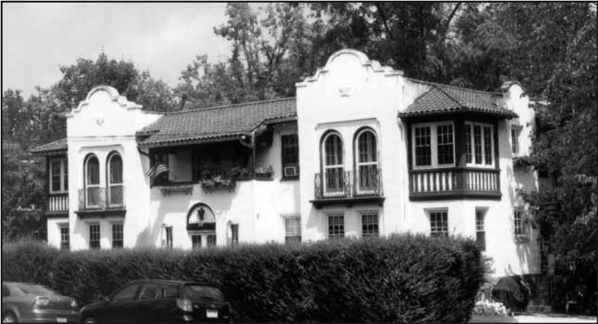
217 Bloomingdale Avenue