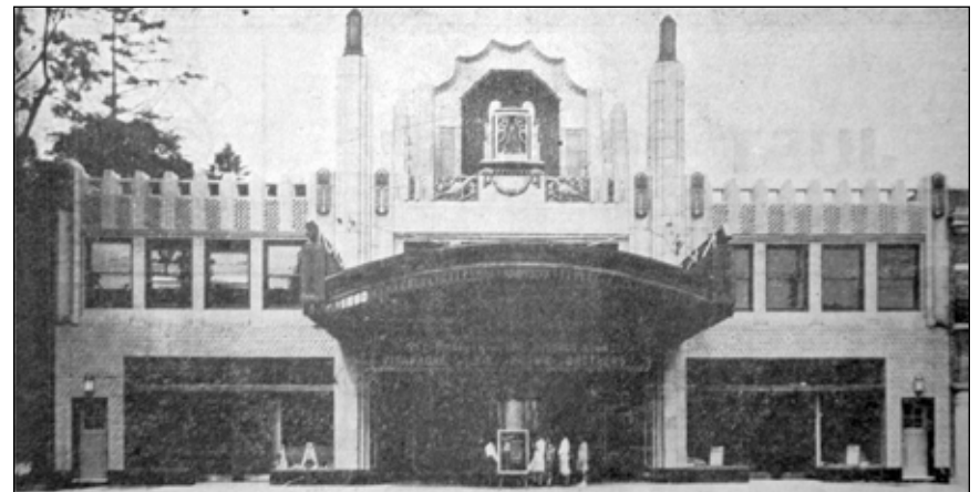
This photograph of the Anthony Wayne appeared in the Suburban in 1930.