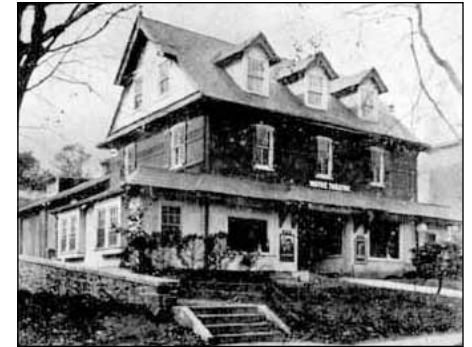
The Wayne Theatre was located on the west side of North Wayne Avenue.

Throughout its various managements, the Wayne Theatre occasionally held movies and vaudeville shows for local causes, some of which included the Radnorite (the Radnor High School newspaper), the Neigh-