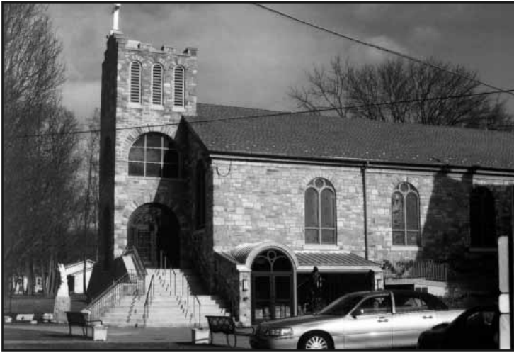
Our Lady of the Assumption Church

Since 1922, the church has been a social center of the Italian community. By the late 1940s, evidence of wear was clear and a massive renovation was begun. The years of labor by the parishioners achieved a completely transformed interior; its dedication took place in August 1950.