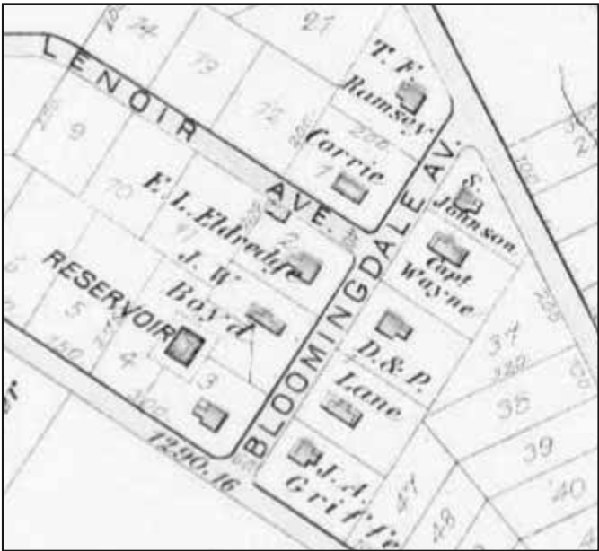
Bloomingdale Avenue Reservoir Excerpt from 1881 Pennsylvania Railroad Atlas